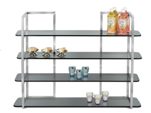
FOUR SHELVES INCLUDED