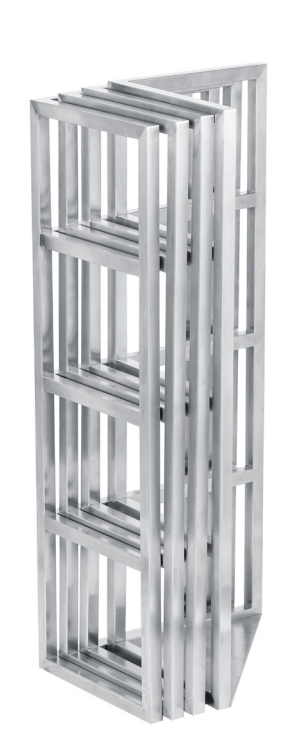
NESTING FOR EASY STORAGE